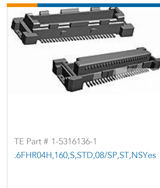
TE Part # 1-5316136-1 .6FHR04H,160,S,STD,08/SP,ST,NSYes