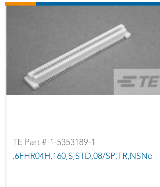
TE Part # 1-5353189-1 .6FHR04H,160,S,STD,08/SP,TR,NSNo