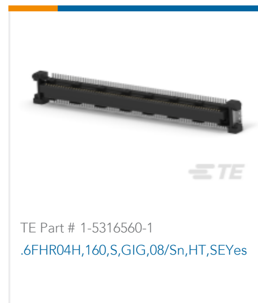
TE Part # 1-5316560-1 .6FHR04H,160,S,GIG,08/Sn,HT,SEYes