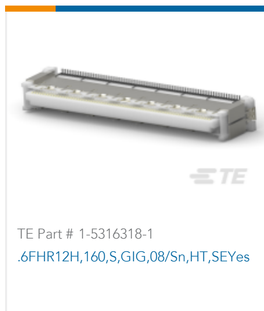
TE Part # 1-5316318-1 .6FHR12H,160,S,GIG,08/Sn,HT,SEYes