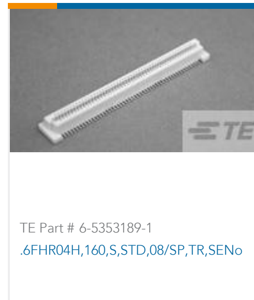
TE Part # 6-5353189-1 .6FHR04H,160,S,STD,08/SP,TR,SENo