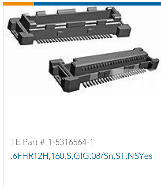
TE Part # 1-5316564-1 .6FHR12H,160,S,GIG,08/Sn,ST,NSYes