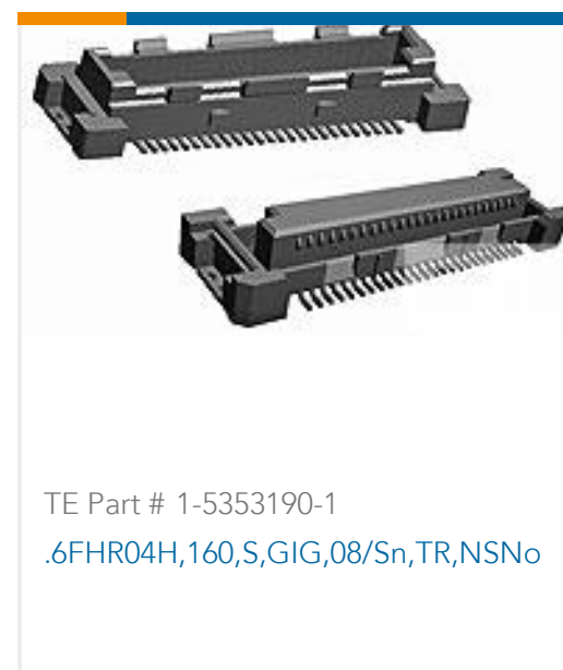
TE Part # 1-5353190-1 .6FHR04H,160,S,GIG,08/Sn,TR,NSNo